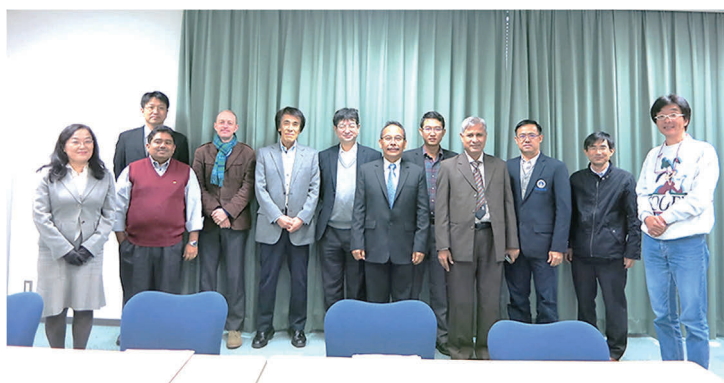
Photo 3-2. The 5th International Advisory Board Meeting