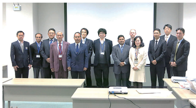
Photo 3-1. The 4th International Advisory Board Meeting