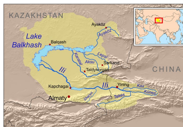
Fig. 2: Location of the Lake Balkhash and the Ili River on the map.

The selected weather stations were located in different parts of the entire studied territory of the Ili-Balkhash region (Fig. 2). Meteorological data from these stations showed an upward trend in air temperature and precipitation, as well as an increase in the water content of the river. However, turning back to the changes in the water regime of the Ili River after the Kapchagay hydropower dam was built in 1969 and the filling of the Kapchagay Reservoir began in the mid-1970s, it is worth clarifying the details. According to the Kapchagay HPP data, between 1970 and 1986 there was a period of filling, during which the flow rate of the Ili River decreased to 426 m 3 /s (13.4 km 3 /year). Over time, the river's flow has settled and become more evenly distributed over the seasons, increasing the flow during low-water periods, and decreasing it during floods. During 1976-1980, due to regulation measures, the maximum water flow directed to the Kapchagay reservoir decreased from 1200-2000 m 3 /s to 783-924 m 3 /s, and the minimum increased to 102-155 m 3 /s.